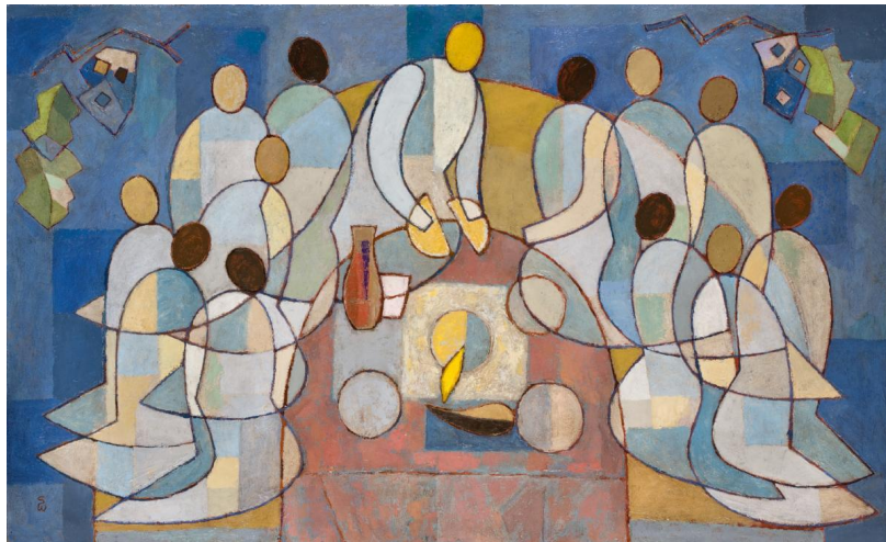
Image: Soichi Watanabe, We all are One in Jesus Christ, mixed media, 2009.