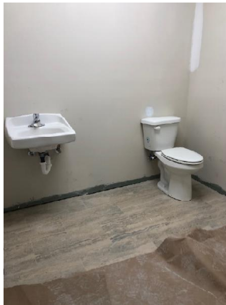
Plumbing fixtures set in restrooms