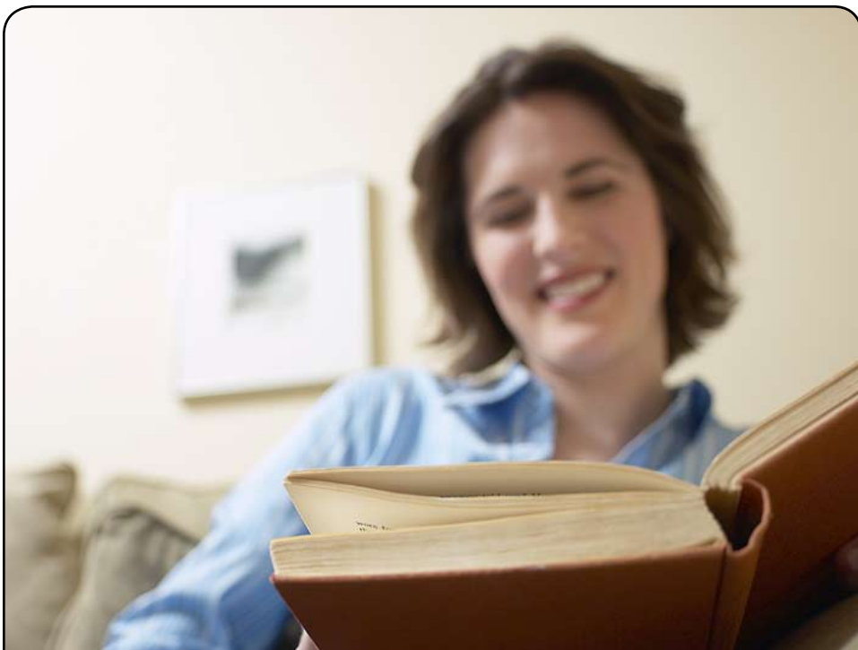
Wellspring Express - Located in the Atrium

You should DEFINITELY consider buying your mom a book for Mother's Day this year. Wellspring Express is located in the atrium. Check it out after the service, and we'll help you find a book she'll be sure to love. Maybe even one of Mrs. Burnham's books perhaps.