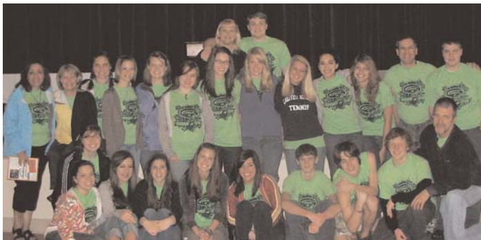
Pictured above: Group photo of the Spring Break Mission Team traveling to Jamaica.

You are invited to the Youth Hall on Sunday, April 20 from 6 - 7 p.m. for a celebration of the two Spring Break mission trips (Ringgold, Georgia & Jamaica). There will be pictures and videos of the trips and testimonies from the students who participated!