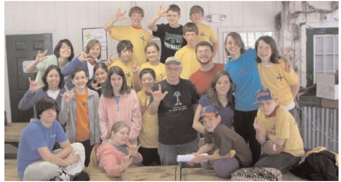
The Junior High Mission Team traveled to Brunswick, Georgia for Spring Break.

We hope everyone will join us for our " Missions Celebration " Sunday, April 19, in the Youth Hall from 5:30-7:00 p.m. If you would like to share snack supper with us, come at 5 p.m. We will show a couple of DVDs of the two mission trips, and hear from the kids about their trips. This evening is for everyone, not just the parents and students who went on the trip! We would love to share with you our experiences in New Orleans and Brunswick.