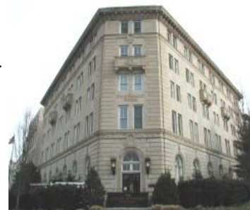
The United Methodist Building in Washington, D.C.

The tour continued with a stop in Indianapolis for an overnight stay and then on to Pittsburgh. We presented a concert in the Pittsburgh area, and also had the opportunity to spend a little time in the beautiful downtown Three Rivers area. After Pittsburgh, we headed for Washington D.C. for three days of concerts and historic sights. We spent time touring some of the landmark places: the Capitol, the Smithsonian, the Washington Monument, the Washington National Cathedral, and the United Methodist Building (the only non-political building on Capitol Hill!). We presented two concerts during our D.C. stay. The tour ended with an overnight stay in Columbus, Ohio, before we returned to St. Louis.