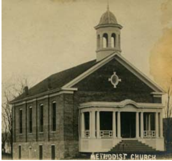
Second-oldest known photo of Chapel.

See the Civil War Ceremony honoring veterans buried in MUMC cemetery performed by the Sons of Union Veterans Group.