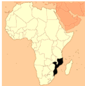
Mozambique, in southeastern Africa

It’s easy to say that a country would develop if it just had more outside financial help, he says. However, the pastor believes large amounts of monetary help wouldn’t help until the residents have broader education to show them how to “make good choices” on development.