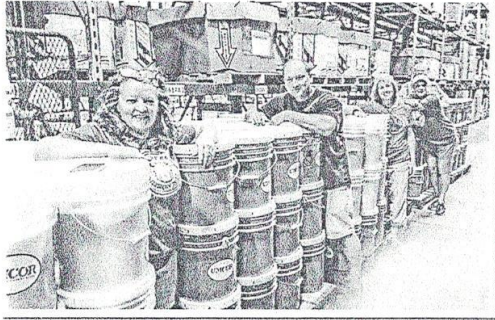
First UMC, Cleveland, TN, volunteered last year sorting flood buckets at Sager Brown UMCOR Depot in Baldwin, LA.

Please collect all kits and coordinate delivery with your District Office, by Tuesday, October 1. You may also give financially. Checks can be made to "Holston Conference" with "Dorian Response" on the memo line and mailed to: Holston Conference, PO Box 850, Alcoa, TN 37701.