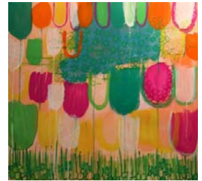
Tulips Grow in the Grass by Pam Stoddart