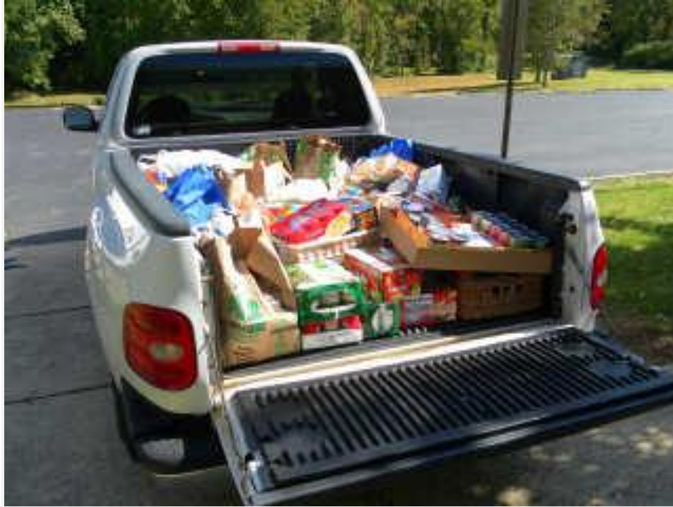
Let's continue to fill up the bed of the old Ford for our neighbors in need!