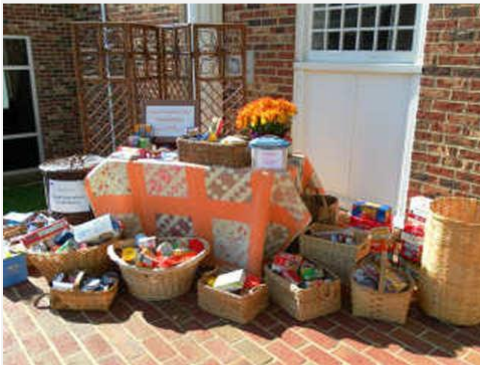
October 2011 Impact Community Day Food Drive for the Good Samaritans Ministries' Food Pantry