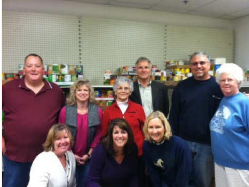
Volunteers from Oak Ridge United Methodist Church gave out food to needy neighbors in November.