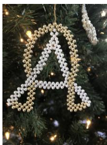
The Alpha & Omega