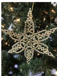
Star of Bethlehem