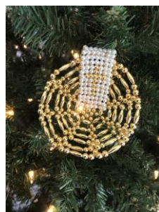
Basin & Towel