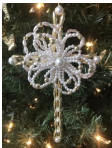
Cross of Mary

In last week's bulletin, you read about the history and symbolism of the Chrismon Tree. Here are a few more Chrismons and their symbolism. Can you find them on the tree?