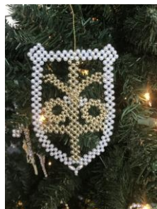
Shield of the Apostle Peter Keys to the Kingdom