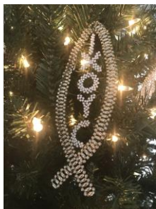
IXOYC (Fish) Symbol of Christianity used in 1 st Century