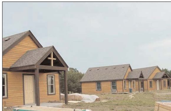
A view of Hope Village at Riverside Lutheran Bible Camp.

With only four more weekends scheduled in July and August, Mission Riverside needs framers and roofers to help with the raising of two more cabins. Many volunteers are also needed for the building of bunk beds, helping to put siding on cabins, and many other projects. Dates are July 7-8, July 14-15, July 28-29 and August 4-5. (Friday nights are optional; mission work happens on Saturday.) To register, stop by the Mission Shack and fill out a registration form or visit www.hopewdm.org/missions to download a registration form.