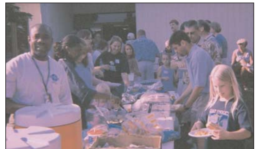
Scenes from NorthBranch's Summer Kickoff BBQ on June 3.