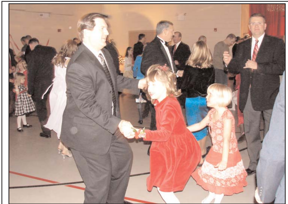
The second annual Daddy Daughter Dance drew more than 500 dads and their sweethearts. Photos are available for purchase at www.lilastafford.photorelect.com . Candid shots can be purchased at http://yourprolabevents.lifepics.com . Use event code 1400. Thanks to all the volunteers who made the event such a success!

March's mission will be a Children's Used Book Drive for several recipient organizations throughout the community and in Jamaica. Watch for details in the bulletin and on "take home" sheets from the kids.