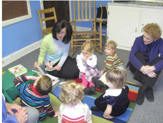
Circle Time is our time to focus on God