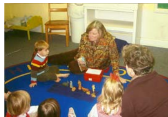
Introducing the Holy Family