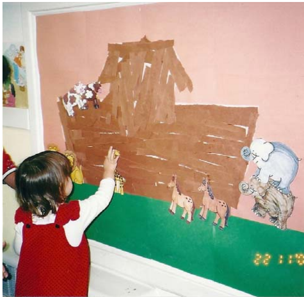
Children work with the interactive bulletin board during circle time to reinforce stories and Bible discoveries.