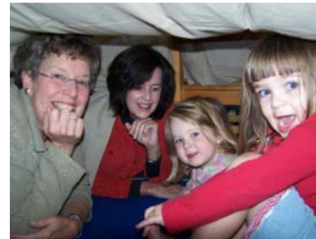
In the Tent