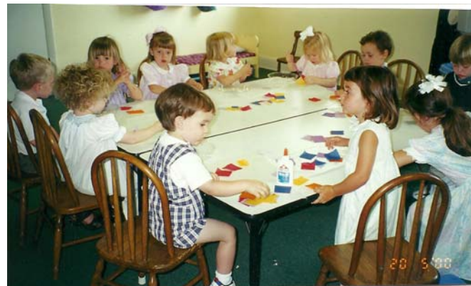
Art time reinforces the lesson