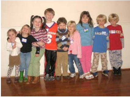
Simon says "Squeeze together for a picture."

Matthew 19:14 - but Jesus said, "Let the children come to me, and do not hinder them; for to such belongs the kingdom of heaven."