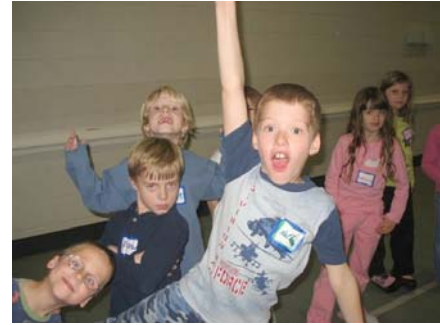
"Parent's Night Out is Great!!!"