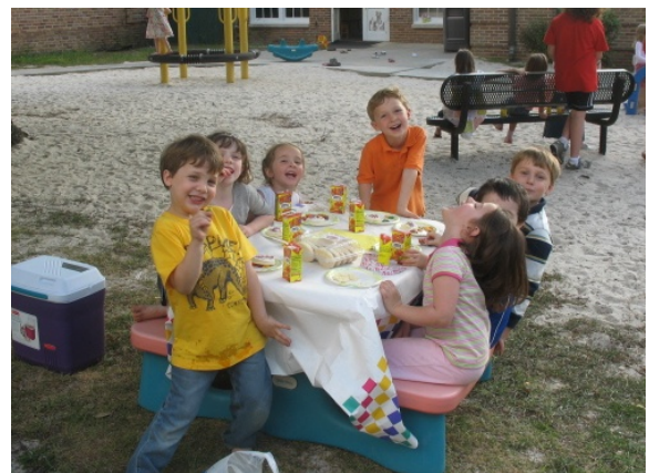
Our preschoolers enjoy an end-of-year party!

From May 3 rd through May 11 th , our Church will host the Tabernacle Experience. This program will bring a life-size replicate of the Tabernacle of Moses to FPC. On Sunday, May 14 th , our 3K through 5 th grade classes will tour the Tabernacle during the Sunday school hour and receive an age appropriate tour of the seven stations of the Tabernacle. Our 6 th graders will tour the Tabernacle on May 3 rd along with the rest of our youth.