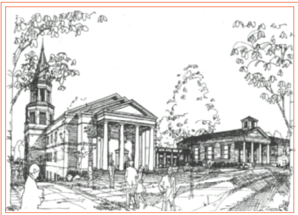
ROSWELL PRESBYTERIAN CHURCH