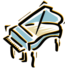
Piano & Organ

Once all in line have received, follow Plate 3 to serve those unable to leave their seats, GATHERING AREA SIDE FIRST.