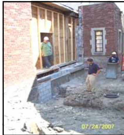
Outside the former office entrance.