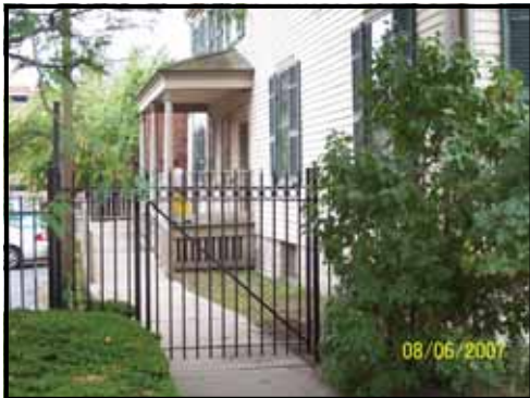
Ramp entrance to Sibley House.