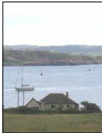
The view from outside our hotel on the Isle of Iona.