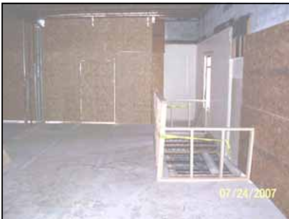
Inside what used to be the parish office w/ the new steps to the basement (near the wall facing Sibley). This photo is looking toward what used to be the entry way and office window facing the church.

Plus countless support staff, construction workers, engineers, etc.