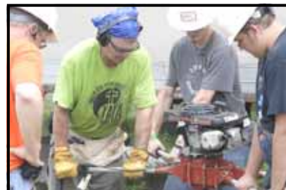
Three guys and the auger