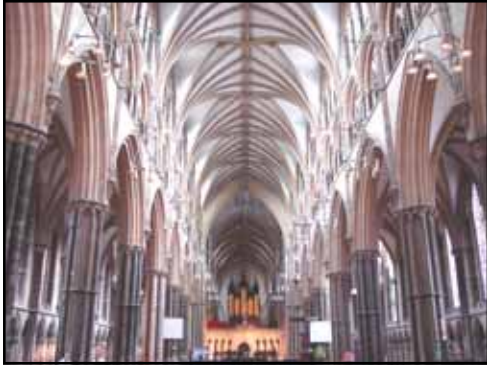
Lincoln Cathedral Interior