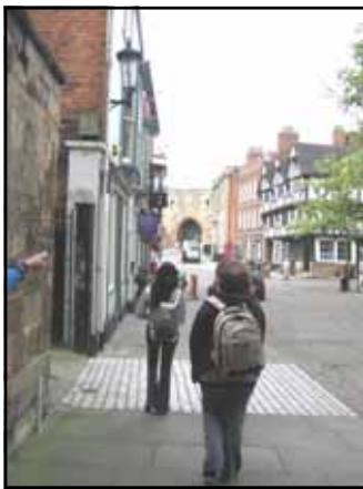
The pilgrims walk around the ancient city of Lincoln.