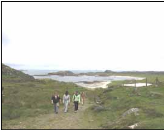
Our group braves the 3 hour pilgrim's walk on the Isle of Iona.

We grew closer through our experiences and came away with a healthy stock of memories, which I feel confident I will never forget. It is impossible to fully capture all that we experienced, except to say that it truly was the trip of a lifetime.