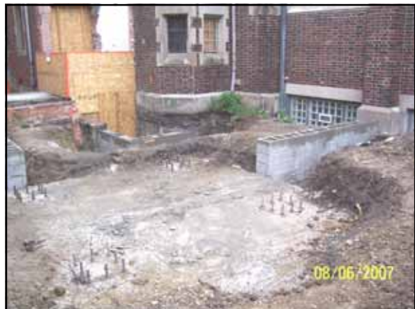
Footing walls and rough plumbing installed (south breezeway).