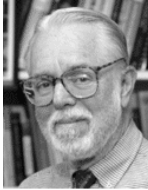
Harvey Cox, Jr. Professor of Religion, Harvard University