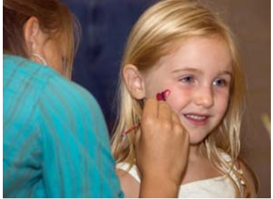
More Sunday Afternoon Activities