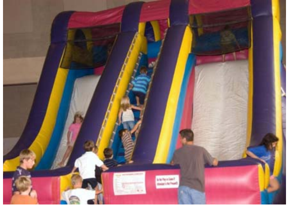
Sunday Afternoon Back-To-School Blast