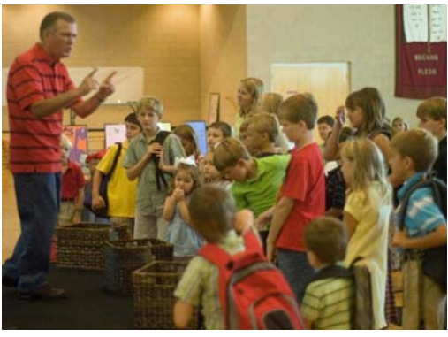
Blessing of the Backpacks