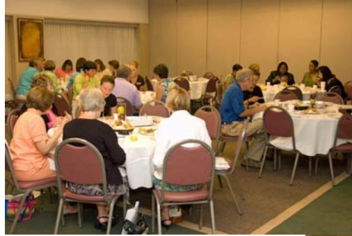
Teachers are Appreciated