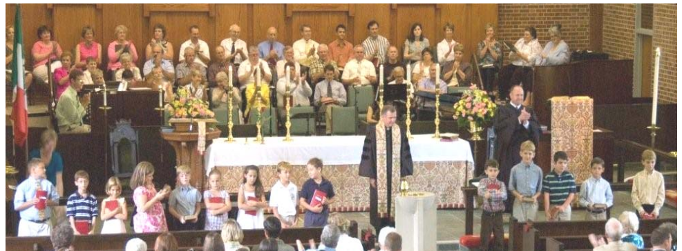
THE FOLLOWING THIRD GRADERS WERE PRESENTED BIBLES DURING 11AM WORSHIP LAST SUNDAY: