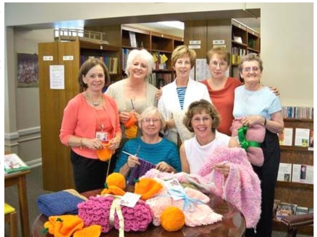
"Joseph's Coat" Volunteers

"Joseph's Coat" will gladly accept any financial donations, yarn donations, gently used lap robes, shawls, afghans, baby blankets and small stuffed animals. This will enable us to continue this outreach ministry.