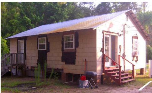
Before and after shots of one of the Salkehatchie home renovations

Despite the heat and one-week time limit, the youth volunteers worked diligently with adult supervisors to accomplish an impressive number of renovations. At one home the crew achieved the following: put up vinyl siding, built two decks, tiled the kitchen floor, repaired sheetrock, painted inside, made plumbing repairs, repaired doors, cut the grass, donated a rebuilt lawn mower, bought a vacuum cleaner and installed a new set of tires (donated by Polk Tires) on the owner's car.