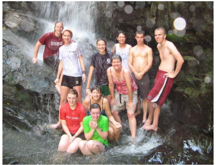
The team takes a welcome break from digging in the hot sun by cooling off in a local waterfall