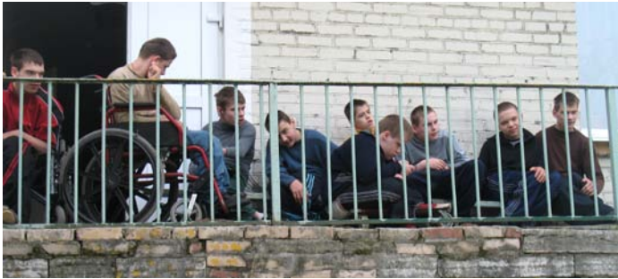
A group of institutionalized youth on a balcony outside their facility in St. Petersburg