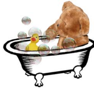
King Bidgoods In The

Another “B” week activity had children in pairs as butter buddies! We danced and shook our heavy cream to music until our butter was ready. Biscuits and butter were a snack-time treat enjoyed by all.