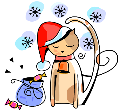
Dreaming of holiday goodies . . .

There are so many things going on in the month of December. Our “Tree for Warmth” will be up from December 1 through December 22 outside the Day School office. We are asking each child to bring socks, hats, scarves, or gloves/mittens for children ages 0-5.