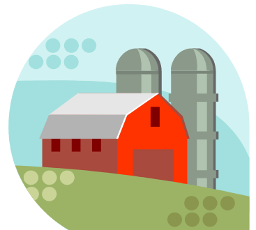
Down on the Farm is one of November's themes.