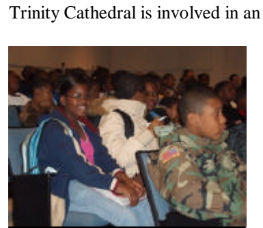
6th graders enjoy Ms. Draper's Presentation in W.A. Perry's beautiful new theatre.