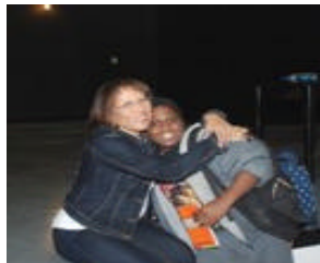
Mrs. Draper and a 6th grade budding writer share a smile!