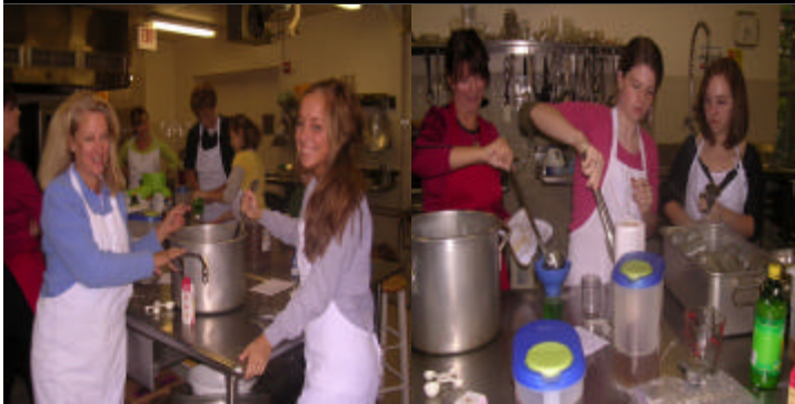
Heathwood Hall high school students and parents make jelly for the Bazaar from herbs grown by Heathwood Hall Preschoolers. Thank you Heathwood Hall!