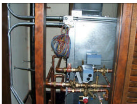
Copper piping in new HVAC unit