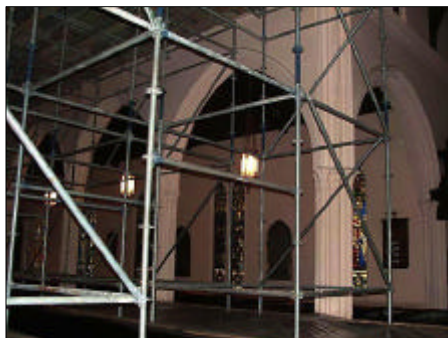
Scaffolding inside Cathedral