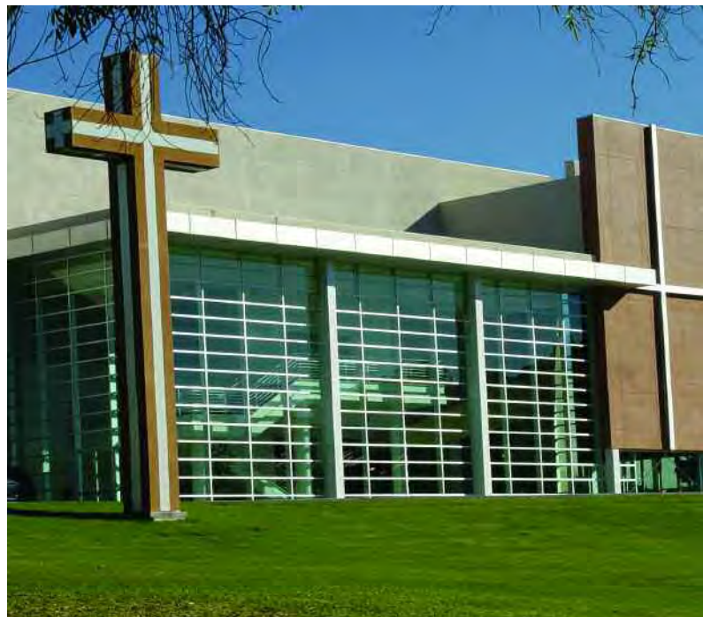
Calvary Community Church (CCC) in Westlake Village, California is a "purpose driven" church. ( www.calvarycc.org )

Today, nearly 5,000 people join in the weekly worship celebrations.”