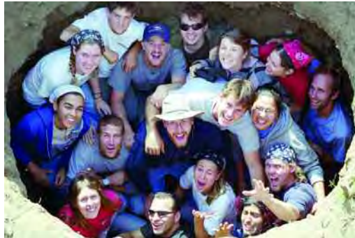
Calvary College Group on a Mission trip to the Kumeyaay Indian reservation outside of Ensenada, Mexico.

Now with a Customer Relations Management philosophy in place and the tools to manage it, CCC can better connect people who attend their worship services to groups and ministries of interest and provide them with information to become involved in a variety of ways. As the church grows each day, it is also working hard to make sure that people are connecting and feeling like they are an integral part of the church. ACS Technologies continues to help by providing innovative solutions for their growing needs. □