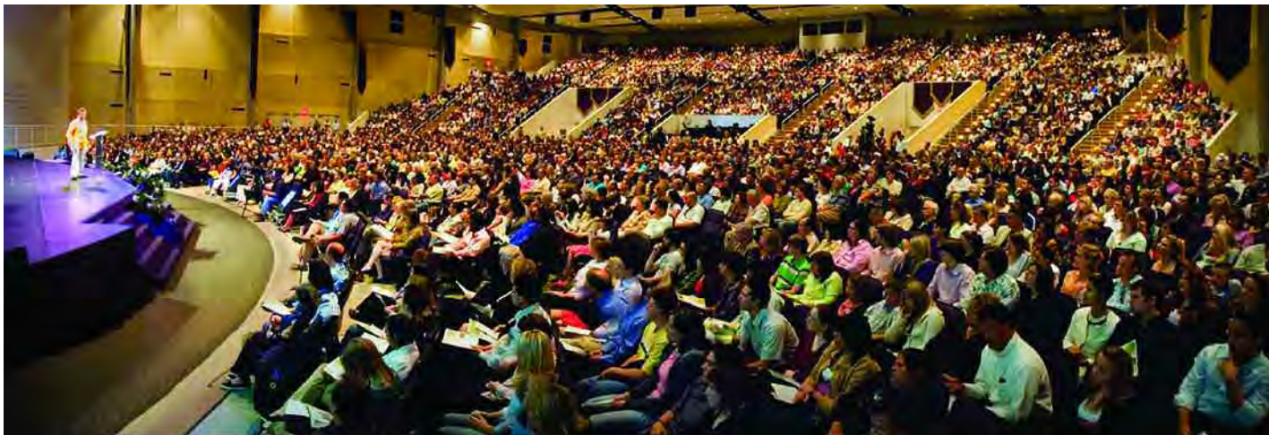
Easter Sunday, 2006

Press added, “Understanding the specific needs of our large church is what differentiated ACS from other competitors.”