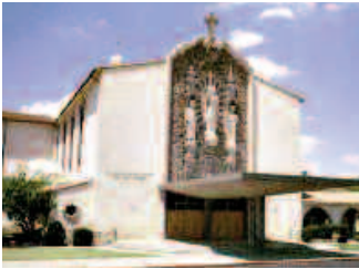
St. Francis Xavier Parish Phoenix, Arizona