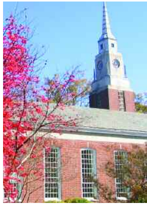
Christ Episcopal Church

Above all, Christ Episcopal Church aspires to help each other grow into the fullness of God's wishes for us. They aim to treat each other with the love of Christ, to approach God with the faith of Christ, and to serve the world in the Spirit of Christ – in order to take after Him in our life together with Him. Established in 1943, Christ Episcopal Church is located in Charlotte, North Carolina, and is a church home to 2,500 adults and more than 1,200 children.