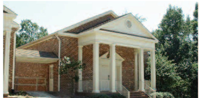
Hermon Baptist Church (HBC)

We saw the cost of the desktop solution, and then compared it to ACS OnDemand. The OnDemand solution was just more cost efficient. It was quite easy to