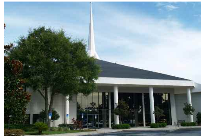
Faith Assembly of God, Orlando, FL

"The biggest benefit of using Fulfillment Services is the ease in knowing that the project was being done quickly and efficiently. The financial savings are a big plus as well."