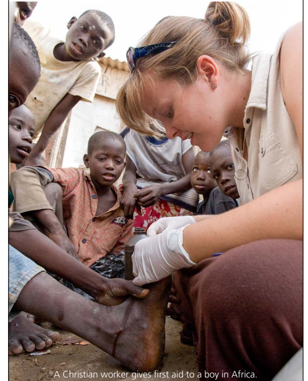
A Christian worker gives first aid to a boy in Africa.

Health-care professionals have the unique skill set to imitate Jesus’ ministry in people’s lives.