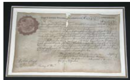
Francis Marion Commission

For more information about Gen. Francis Marion, go to www.fmarion.edu/news/generalmarion .